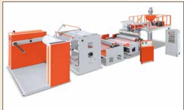
WENZHOU ZHETUO MACHINE Air Bubble Film Making Plant.