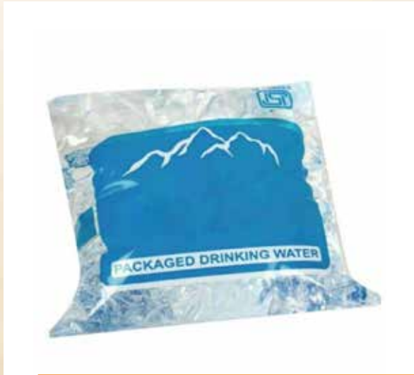
Water Pouch Poly