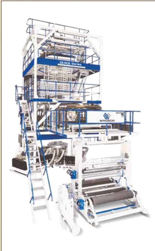
WINDSOR MACHINES Three layer co-extrusion blown film lines.