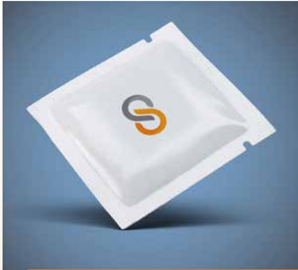
Medical Pouches Poly