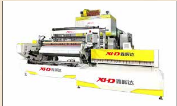
XHD MACHINES 3 Layers 1500mm LLDPE Cast Stretch Film Machine. 2 Layers 1000mm LLDPE Stretch Wrap Film Machine.