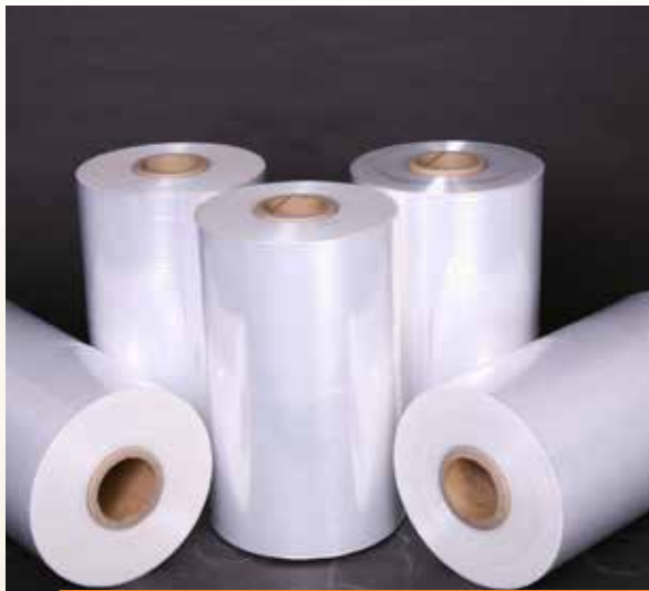
Multi Layer Lamination Films