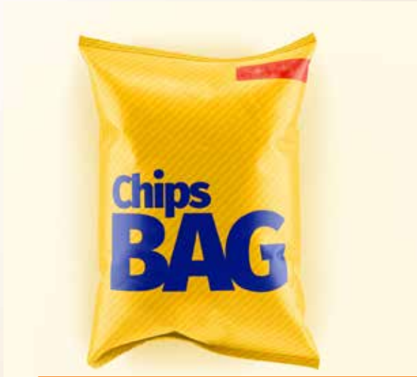
Nitrogen Flush Poly