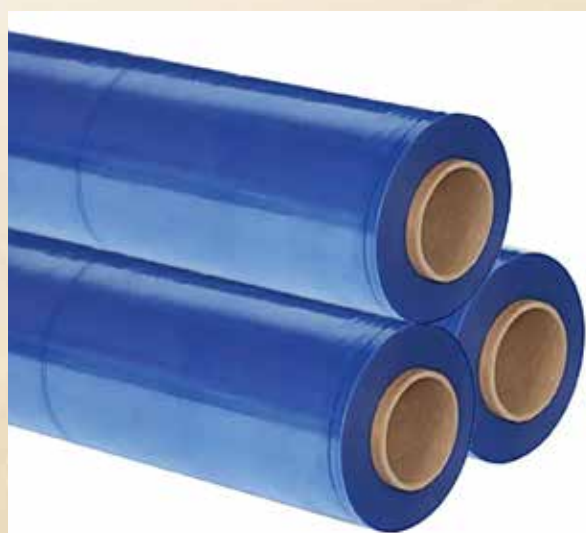
VCI/Rust Protection Film