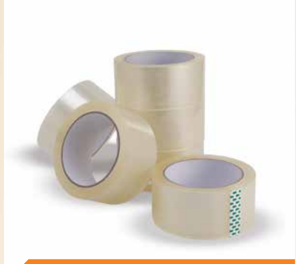
BOPP Tape Rolls