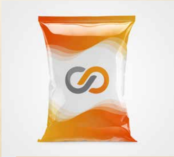
Atta & Pulses