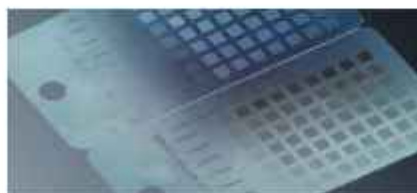
Metal test piece