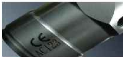
Metal auto parts