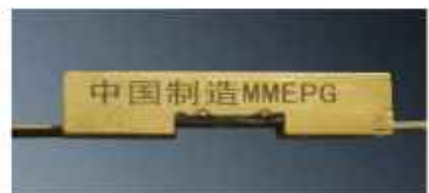
Aluminium plated 2